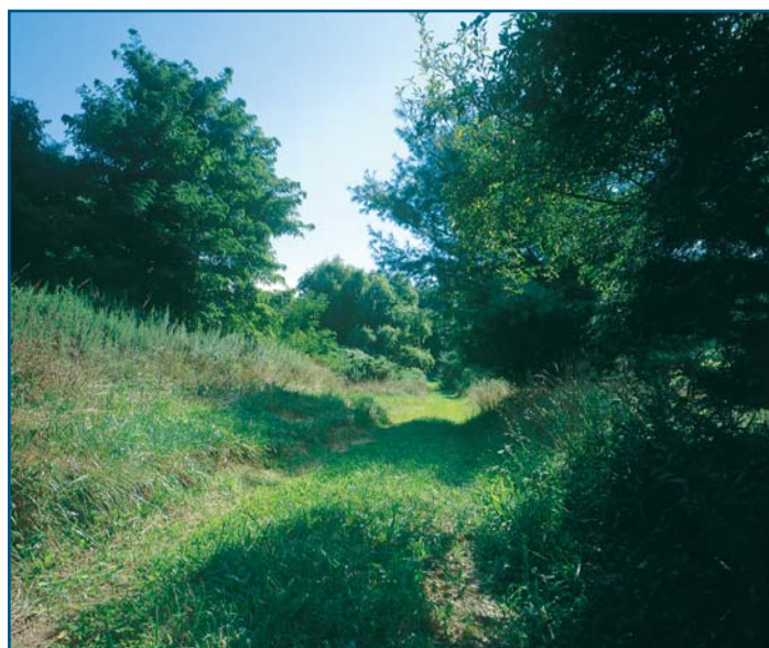
Shelter Island Nursery Preserve

The Trust received a gift of a conservation easement on 7.5 acres along Little Ram Island Drive in Shelter Island. Consisting of two parcels with over 750' frontage on Coecles Harbor, this easement reduces density from three potential homesites to a single, existing site. In addition, the significant scenic vistas and wildlife habitat are protected.