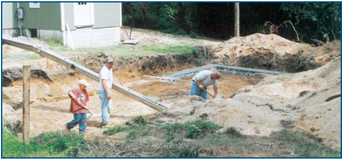
Workers ready the foundation for the schoolhouse.