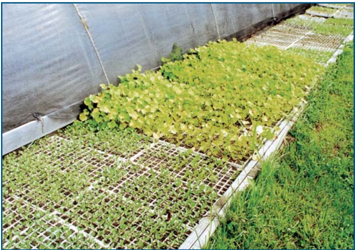
Spring seedlings soak up some sun...