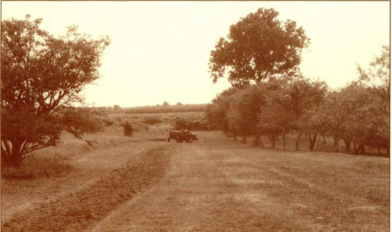
Quail Hill Preserve