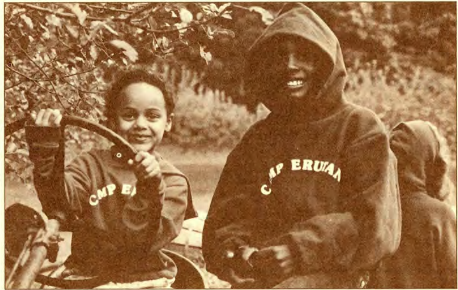
Camp Erutan (Nature spelled backwards!), a camp for abused children based in Los Angeles, California, brought its program to the East End last September with the help of the Peconic Land Trust and Quail Hill Farm. Farm staff showed campers the ins and outs of organic farming.

Indeed we have changed, but not so as to be defined by figures or as a matter of scale alone. We are still here for the same reason: to provide a local source of organic food through the practice of sustainable agriculture, and to do this through a cooperative effort. Community Supported Agriculture implies that a community is willing to share the risks that farmers usually