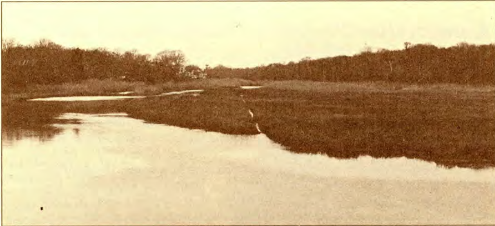
Jagger Preserve, Westhampton, looking north from South Country Road, just east of Brushy Neck Lane at the bridge.