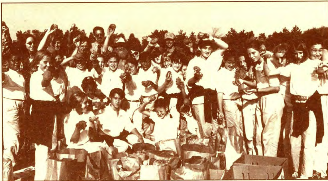
Last fall, Peconic Land Trust hosted a group of 30 students and teachers from the Ross School at the Trust's Quail Hill Preserve in Amagansett. Quail Hill stewardship staff helped the students harvest 800 pounds of potatoes which were then donated by the Trust to Long Island Harvest, an organization that distributes surplus farm crops to those in need.