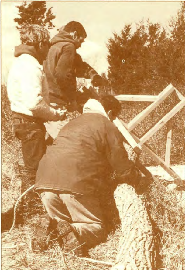
Land stewardship is ongoing. Here, an osprey tower is readied on-site at East Point Preserve overlooking the Shinnecock Bay in Hampton Bays.