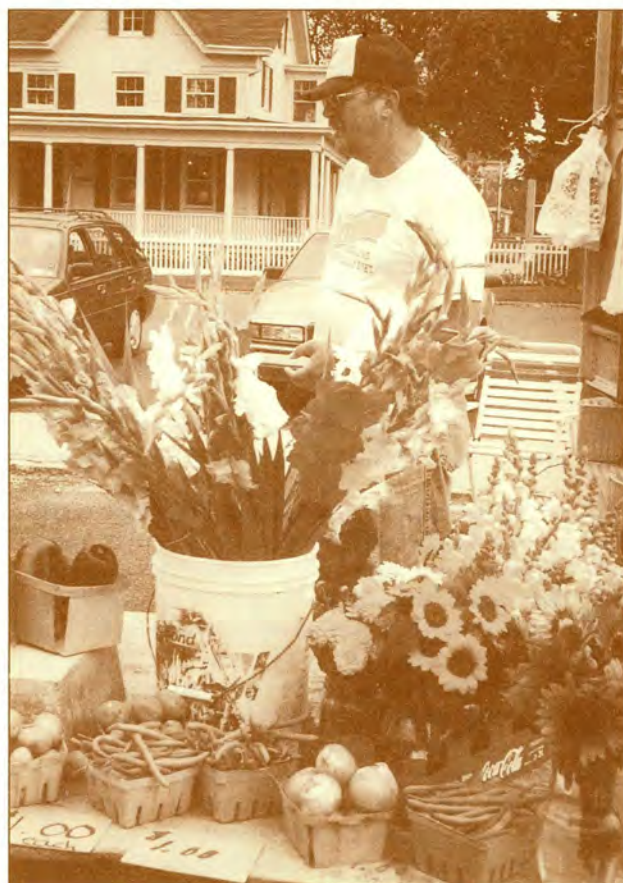
Vegetables and flowers were in abundance at the Riverhead Farmer's Market.